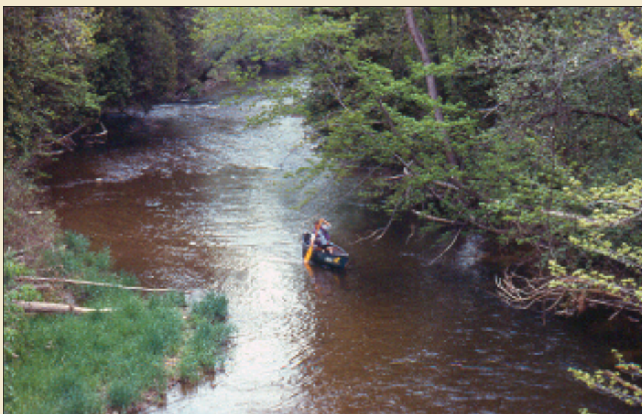
Whitemans Creek - a water handrail leading to the Thames River from the Grand River.