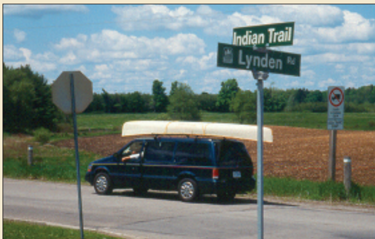
Indian Trail is a curved road leading to the Cainsville Oxbow on the Grand River.

Trail logic dictates that the distance between two endpoints (the first things to determine are endpoints) should be as short as possible though various forces "pull" one away from a straight-