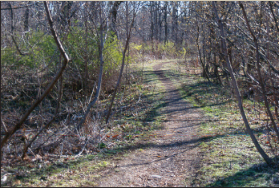
An old laneway/trail believed to be a part of the old portage.

Noisy River with over 70 kilometres of trails. 1 These trails joined over nine villages and hamlets and Jesuit missions in the 1630's. One of the trails followed a southerly line to Lake Ontario and along the Niagara Escarpment likely joining what is still called the Mohawk Trail today. This trail would then logically join the